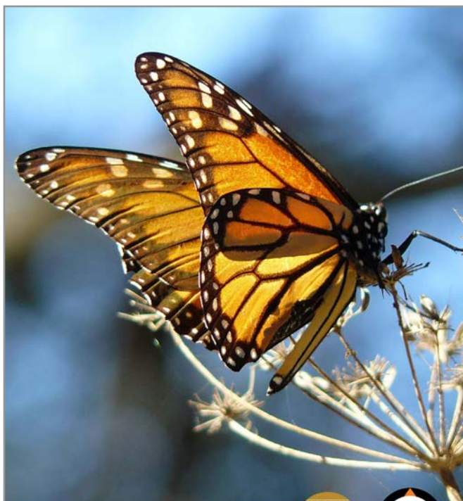
Collateral Damage: How Factory Farming Drives Up the Use of Toxic Agricultural Pesticides

Thanks to your support, we produced a report earlier this year that reveals the devastating impacts of toxic pesticides used in factory farming. The 'Collateral Damage' report exposed the fact that 235 million pounds of chemicals were applied to corn and soybean crops grown for farmed animal feed in the US. These toxic chemicals are threatening thousands of at-risk wildlife including insects, birds, and fish. Pesticides are also destroying the habitats on which these animals rely for shelter and food.